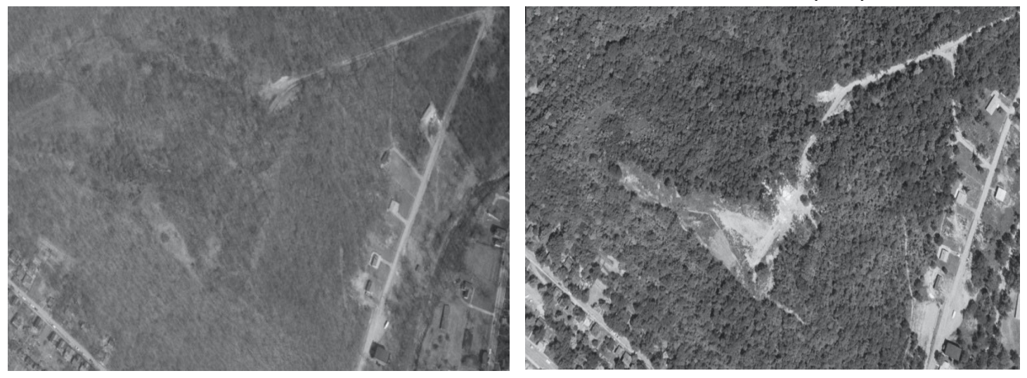
FIGURE 3.3.4-C (1969)