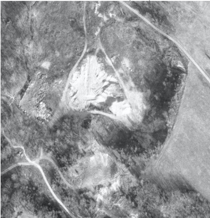
FIGURE 3.8.3-C (1993)