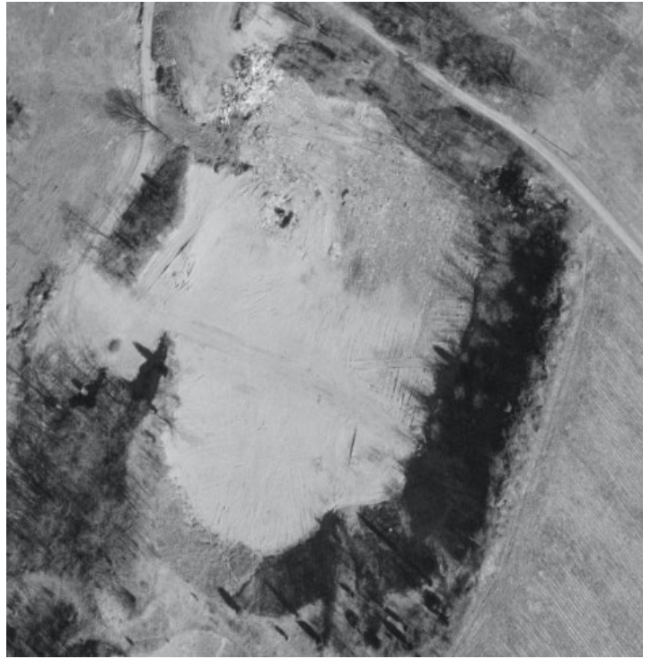
FIGURE 3.8.3-B (1986)